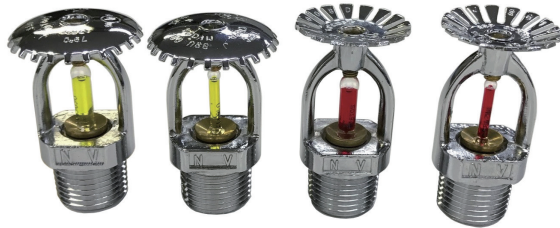
NV003 NV004 NV005 NV006